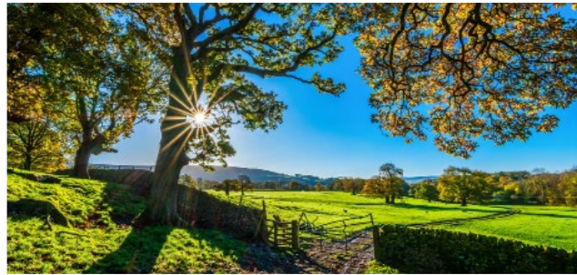
Walks in the Yorkshire Dales