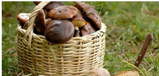
Wild Food Foraging with Broughton Chef