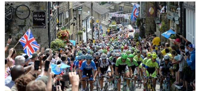
Cycling the Tour de France route