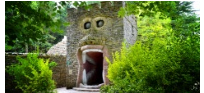
The Forbidden Corner