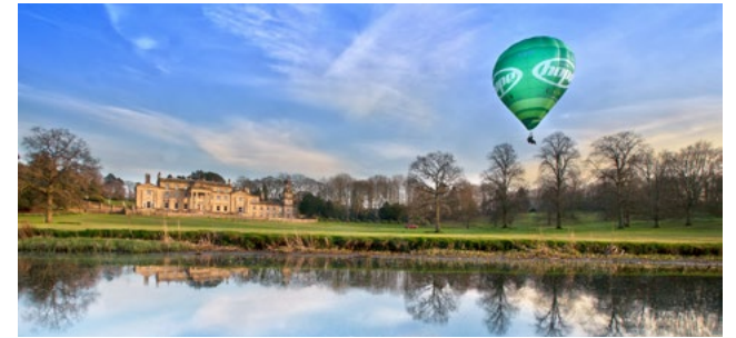
Balloon Ride over the Dales