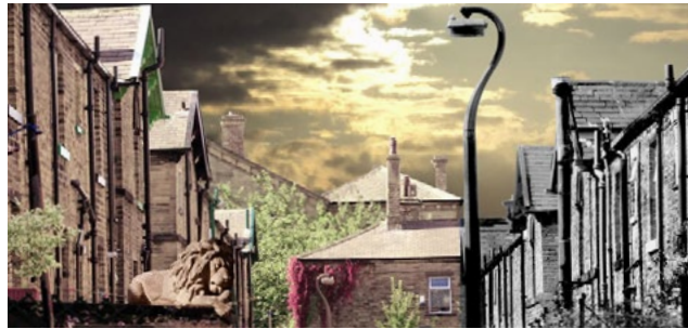
Saltair Heritage Tours