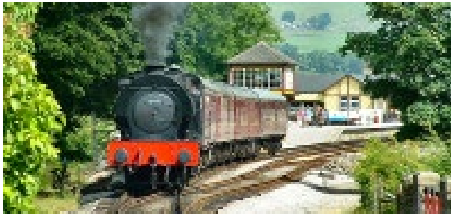
Embsay & Bolton Abbey Steam Railway