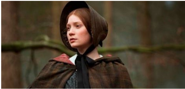
The Brontë Parsonage Museum

There are endless activities, tours and places of interest to experience during your stay at Eden. Here are some ideas to help you make your stay in Yorkshire even more memorable.