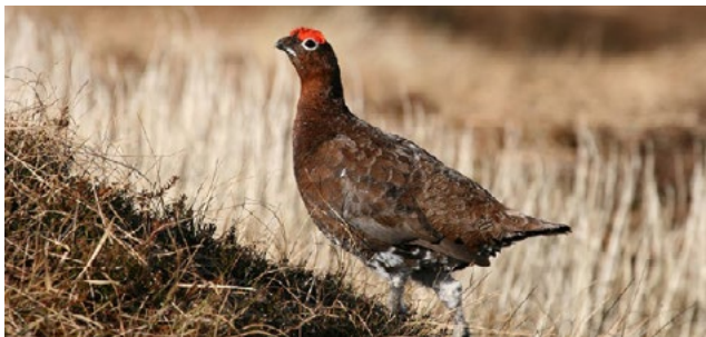
Grouse Sighting at Broughton